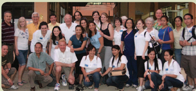
2011 Uplift Internationale Volunteer Team

Mission 2011 – Uplift Internationale enters its third decade of consecutive missions this coming February. Last year an international cast with members from as far as Bahrain and the British Isles returned to the city of Roxas on Panay Island. The 2010 mission was a single site 7 day affair to the same site visited in 2009. Returning to Roxas allowed completion surgery on multiple complex cases started the year prior in addition to an entire phalanx of new cases.